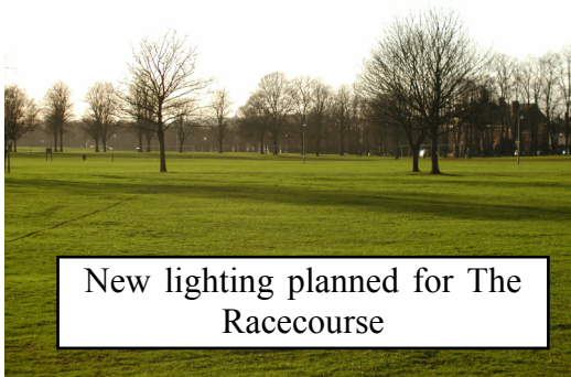
New lighting planned for The Racecourse