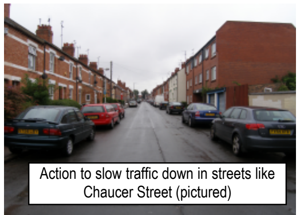
Action to slow traffic down in streets like Chaucer Street (pictured)

'Table junctions' along Kingsley Park Terrace These raised junctions will slow down traffic entering or exiting the streets and make it easier for pedestrians to cross. They will also