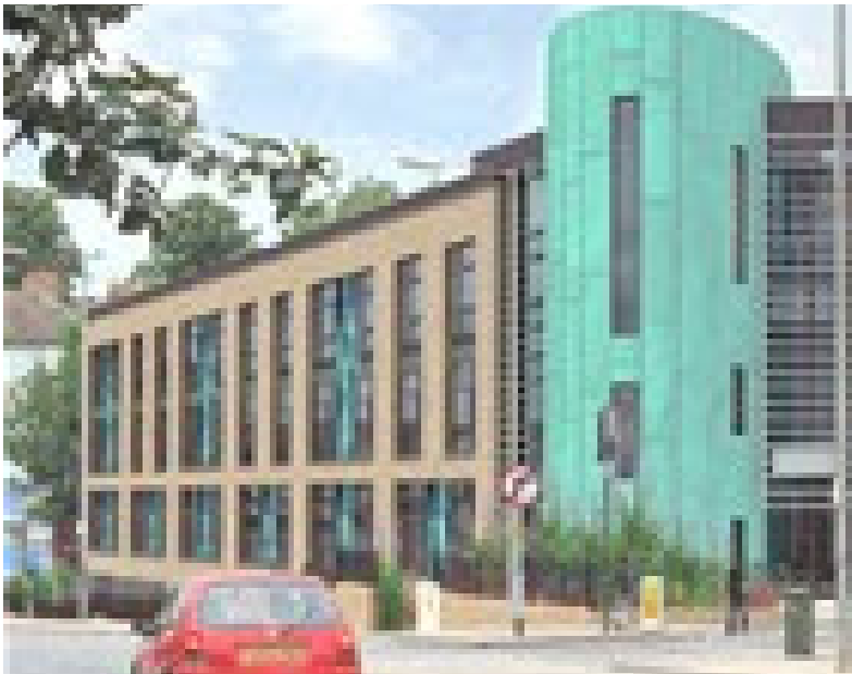
A new home for homeless -Under construction on the Mounts

Since 2007 the Liberal Democrats have reduced the number of households in temporary accommodation down to only 22 households on average during 2010.