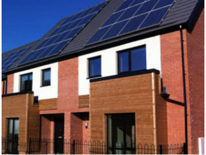
New Council homes in Kings Heath- built to high environmental standards

Since 2007 the Liberal Democrats have embarked on a programme to improve our council homes for our tenants. In phase one of our Decent Homes Standard Programme 640 homes have been upgraded. In phase two a further 3,982 homes will be improved.