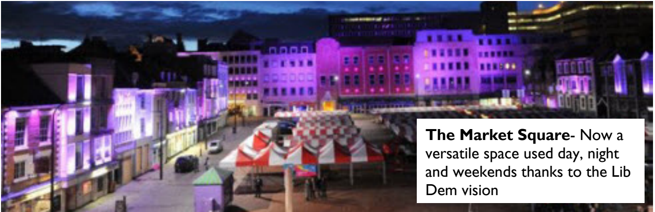
The Market Square- Now a versatile space used day, night and weekends thanks to the Lib Dem vision