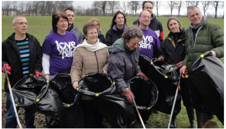
Community clean-up on the Racecourse